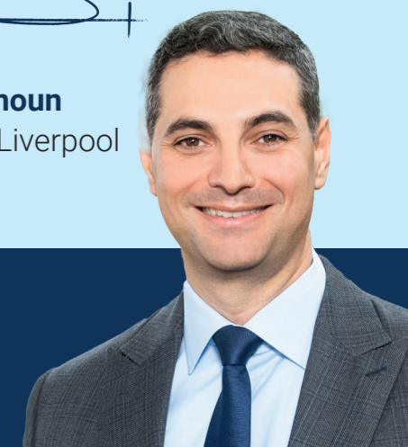
Ned Mannoun Mayor of Liverpool